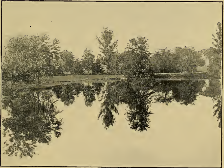
THE COLLEGE POND